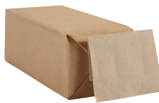
Dixie® Full-Fold 1-Ply Napkin Dispenser Refill 37835