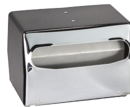
Dixie® Full-Fold Napkin Dispenser 51602