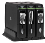
Dixie Ultra® SmartStock® Wrapped Cutlery Dispensers, Series-W, Triple Pack SSW3D85