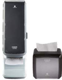
Dixie Ultra® Interfold Napkin Dispensers 54550A | 54527A