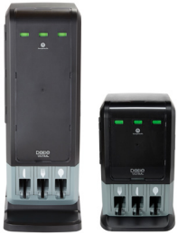
Dixie Ultra® SmartStock® Tri-Tower Cutlery Dispensers DUSSTDSP3 | DUSSTDSP3MINI