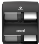
Compact Quad® Plus 4-Roll Coreless High-Capacity Toilet Paper Dispenser 56744B